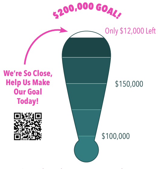
Give Today at donors.mypregnancychoices.com

In addition, so many of you gave generously, recommitting to life through financial gifts to support women and men each day. We witnessed your steadfast, unwavering commitment to life.